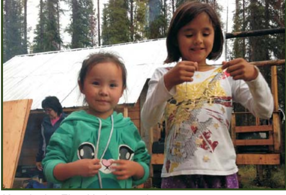
Kwadacha First Nation youth