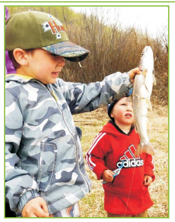
Dease River First Nation youth

Establishment of Committees where appropriate (ie: Governance Committees)