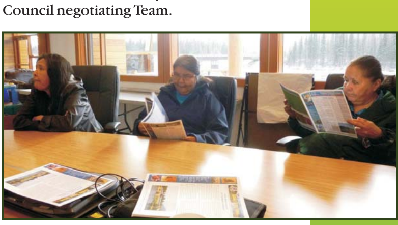
Kwadacha First Nation elders

The community representatives will be hired in each community by July 14th. A part of their role will be to provide the connection between the community and the Kaska Dena Council negotiating Team.