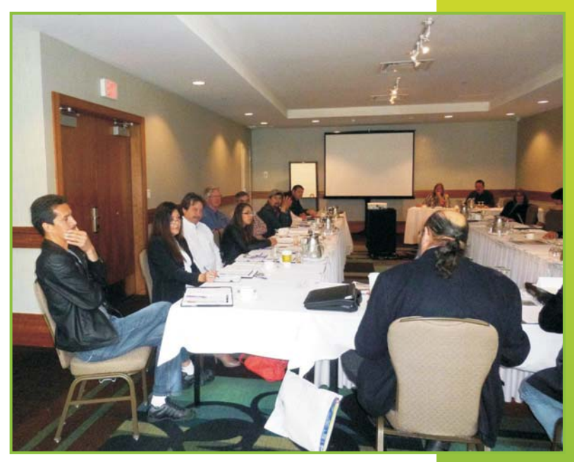
Kaska Dena Strategy Session

Day 1 of the Strategy Session focused on hearing abut the experiences of other First Nations who have negotiated a Treaty under the BC Treaty Process.